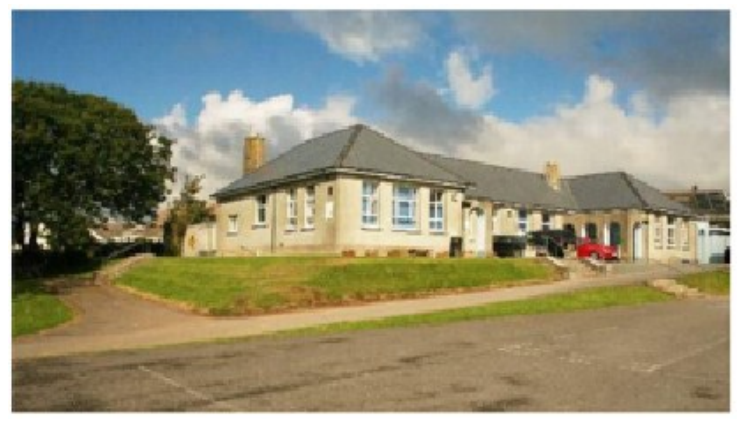
Solva Community School