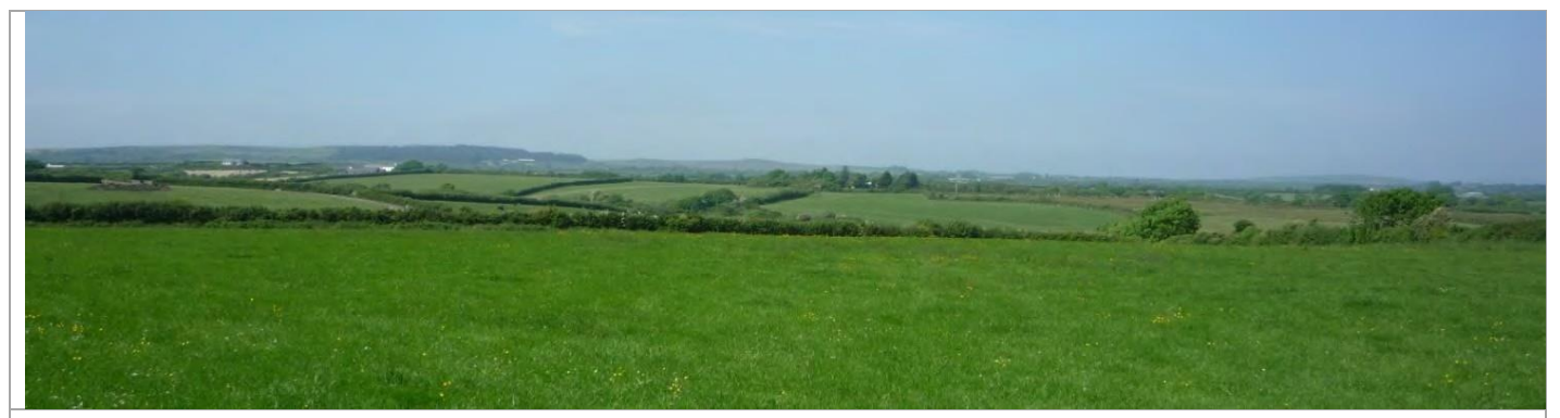
View from the A487 to the North East, with Dudwell Mountain (LCA6) beyond