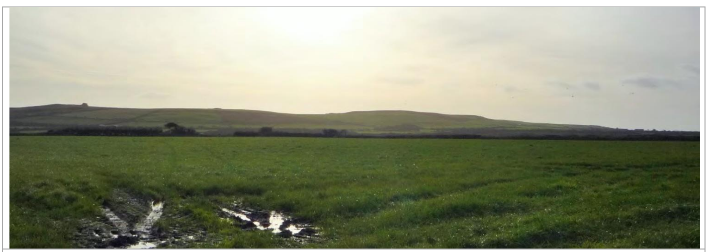
View across Plumstone and Dudwell Mountains from the north