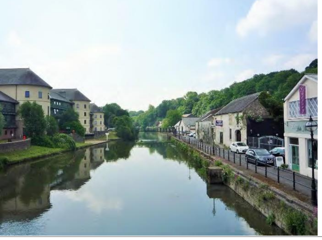
Gateway into Haverfordwest historic centre over Western Cleddau bridge and the urban river corridor