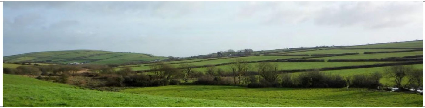
View onto Great Treffgarne Mountain from the east

This LCA is a low undulating upland ridge of open moorland, rocky outcrop and prehistoric features such as tumuli at Plumstone and Dudwell Mountains and farmland on Great Treffgarne Mountain bordered by Nant-y-coy Brook to the north east. The slopes comprise enclosed pasture with a few areas of small low growing woodland blocks interspersed among the semi-regular fields on the mid and lower reaches of the hills including a managed conifer plantation to the south west.