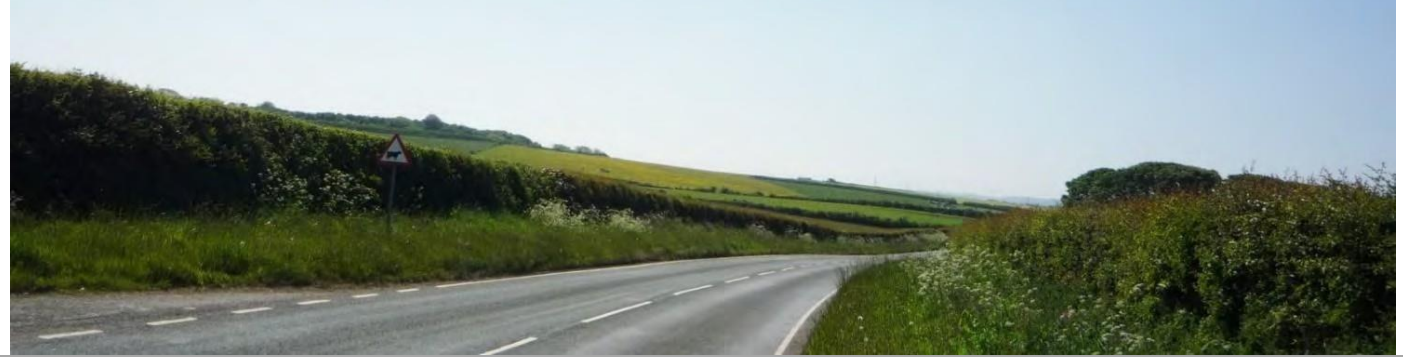
Road south from Sentry Cross to Waterston

This LCA comprises of rolling pastoral and arable land interspersed with numerous energy-related developments, ranging from large scale oil and gas storage related to the Milford Haven Waterway to wind turbines and solar arrays. The settlement pattern is predominantly small scale rural with some 20<sup>th</sup>/21<sup>st</sup> century extensions but the larger settlement of Neyland lies with its marina to the east and the town of Milford Haven is a presence. The small scale incised wooded valleys provide more intimate landscapes within the broader sweep of the rolling agricultural plateau.