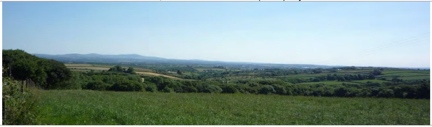
View north east from west of Portfield gate.

This LCA comprises of a rolling primarily pastoral open landscape of ridges and low hills punctuated with small, enclosed wooded valleys. There are patches of rough grazing, scrub and heath. Larger settlements tend to be on the ridges and associated with roads radiating from Haverfordwest. Farmsteads and isolated dwelling houses punctuate the tranquil areas between. The western edge lies within the setting of the National Park.