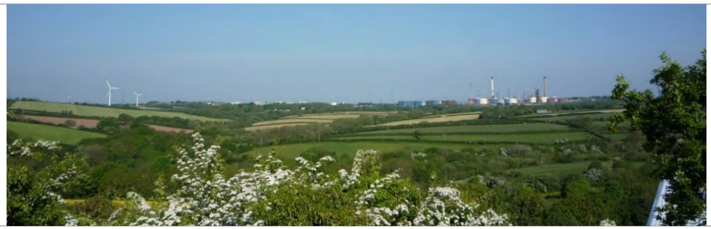
Views towards the former Murco Oil Refinery from Thornton Ind Estate (LCA22)