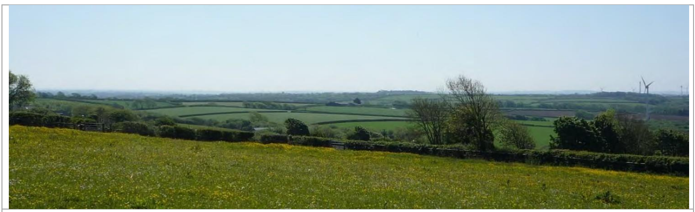
Views south from Bolton Hill (west of Johnston)