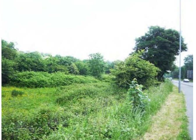
Merlin Brook valley floor

Haverfordwest is the county town and its historic core has developed alongside the Western Cleddau river, lying mainly on slopes to the west, and includes priory ruins, castle, gaol and riverside warehouses. It has developed substantially in the 20<sup>th</sup> century including public services, residential and retail development. Haverfordwest is the infrastructure hub of the County with many road routes converging on the town and a railway which give it a sense of movement. Strong green corridors exist including the Cleddau itself and Cartlett and Merlin Brooks corridor with associated grassland and steep wooded slopes to the south.