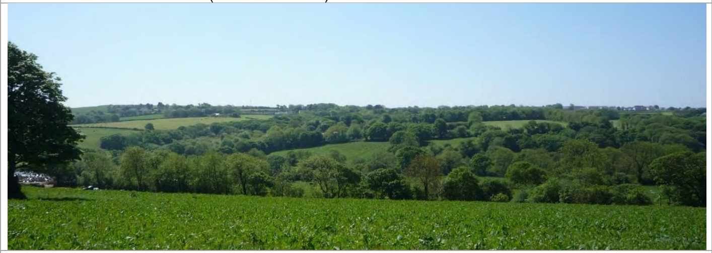
View south from the edge of Llangwm

This LCA is a rolling plateau landscape of gentle hills and wooded valleys. Farmland is dominated by high quality pastoral agriculture with hedgebanks and some arable, rough grassland and woodland blocks. The area is interspersed with scattered village settlements and farmsteads some of which have a strong historic character such as Rosemarket or Llangwm linked by quiet rural lanes. Busy A roads run north south, the A4076 and A477, between Haverfordwest to the north and Milford Haven and Pembroke Dock to the south. Johnston is the largest settlement and hosts both commercial and industrial/business uses. The area to the east is more tranquil and rural in character closer to the Western Cleddau, Daugleddau and the National Park. Views south to the Haven are dominated by refineries and wind turbines and pylons in places and solar farms lie to the south west.