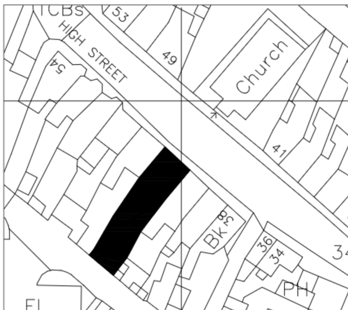
ORDNANCE SURVEY MAP (NTS)