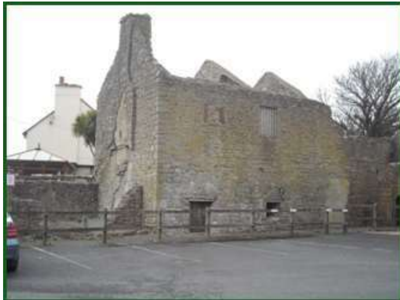
Lydstep Palace Lydstep