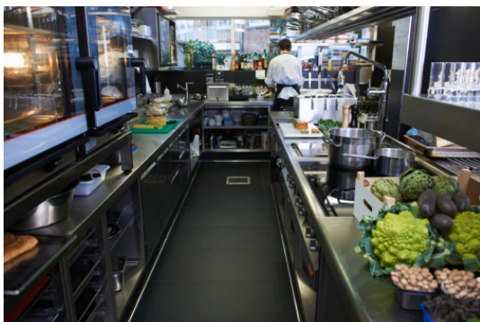
Reduced staffing levels to maintain social distancing